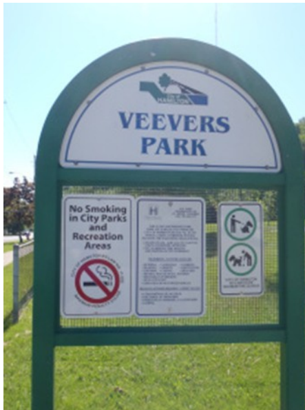
Veevers Park, named after the Veevers family

With the Adopt-A-Park Program a group adopts a City of Hamilton park. The park remains the property of the City but the community group helps maintain it through regular litter cleanups, removing graffiti, weeding and generally keeping an eye on the park.