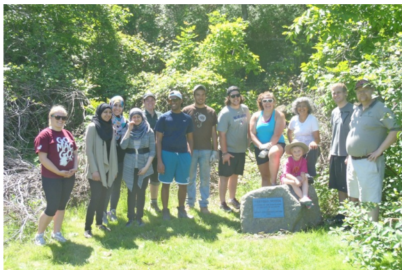
Photo: Volunteers and Green Venture staff after cleaning up Veevers Park

For more information please contact Kim Dunlop: volunteer@greenventure.ca , 905-540-8787 x157