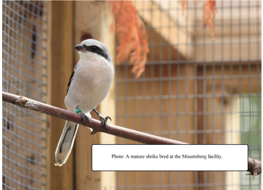
Photo: A mature shrike bred at the Mountsberg facility.

If you would like to support the Shrike Recovery Project, go to: https://www.canadahelps.org/services/wa/dnm/en/#/page/5956