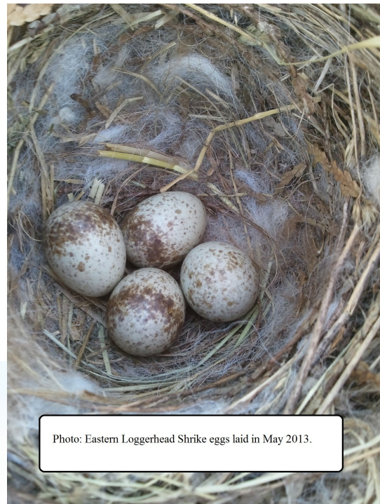
Photo: Eastern Loggerhead Shrike eggs laid in May 2013.