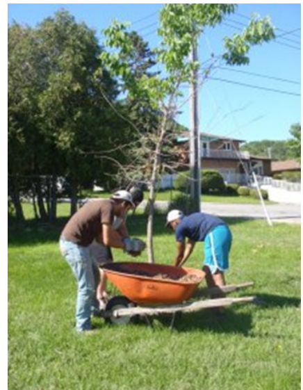
Mulching trees in Veevers Park

Becoming involved in the Adopt-A-Park Program was incredibly easy and before we knew it we were hosting our first park volunteer event as part of the annual Davis Creek Community Cleanup event this past spring. Early in June we hosted our next event, a park beautification day where volunteers and staff worked together to pick-up litter, clean graffiti, pull invasive weeds and put wood chips around the park trees.