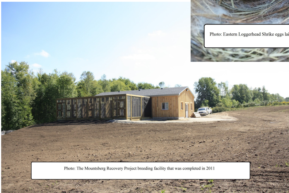
Photo: The Mountsberg Recovery Project breeding facility that was completed in 2011