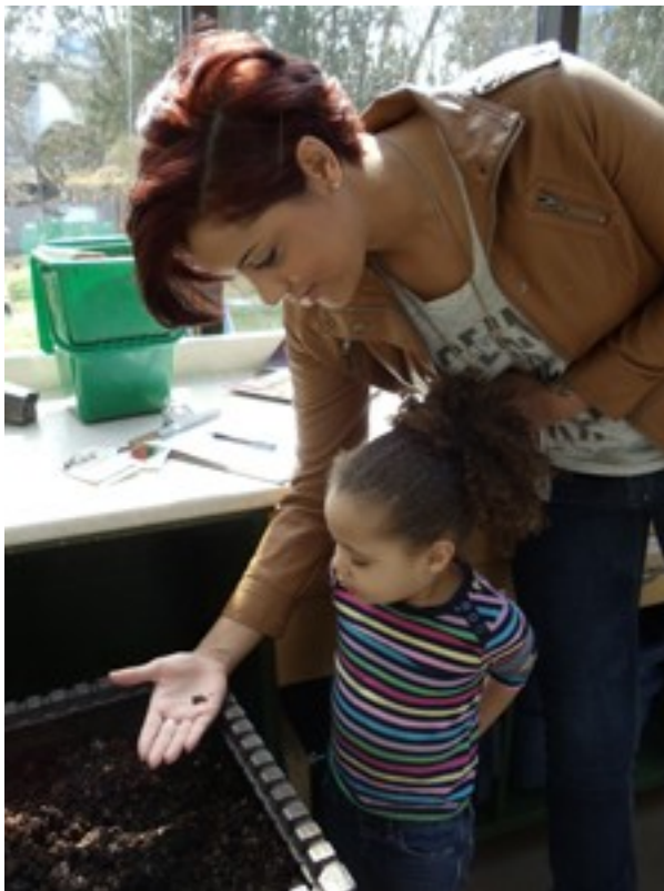
Photo: Visitors enjoy exploring indoor composting with worms at Green Venture's EcoHouse.

For more information contact Elley Newman: elley.newman@greenventure.ca or 905-540-8787.