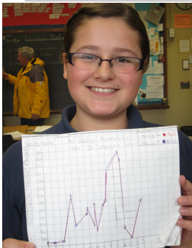
Photo: Student proudly displays neighbourhood air quality data.

these positive changes and behaviour are extended into other areas, so I think other schools should adopt these campaigns as well. And furthermore the students learned that they can affect positive change in the world through their own actions.